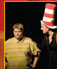
Seussical - 2007