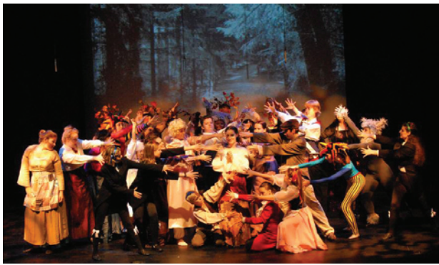
Into The Woods Junior - 2008