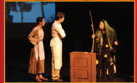
Into The Woods Junior - 2008