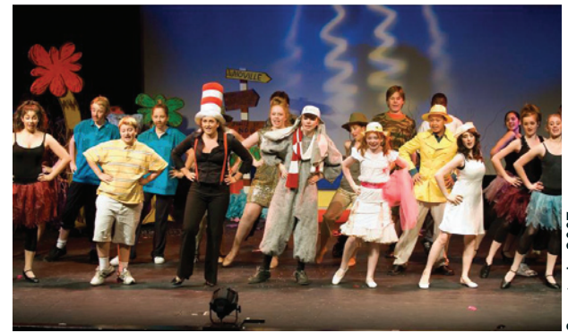
Sussical - 2007