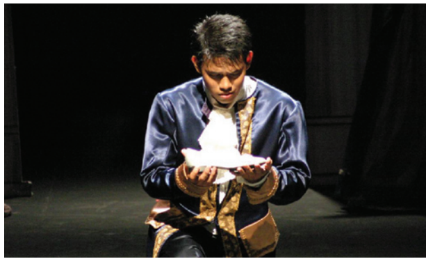
Cinderella - 2006